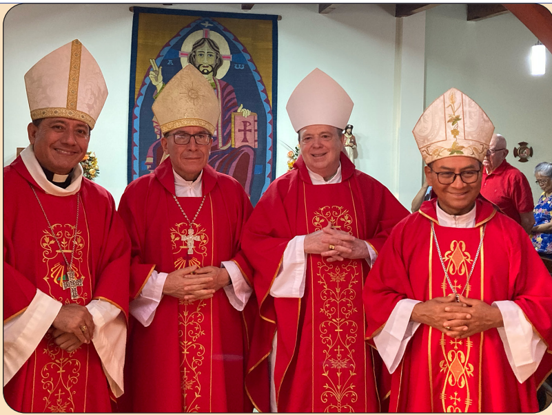
The Bishops celebrating Mass at the Annual General Meeting