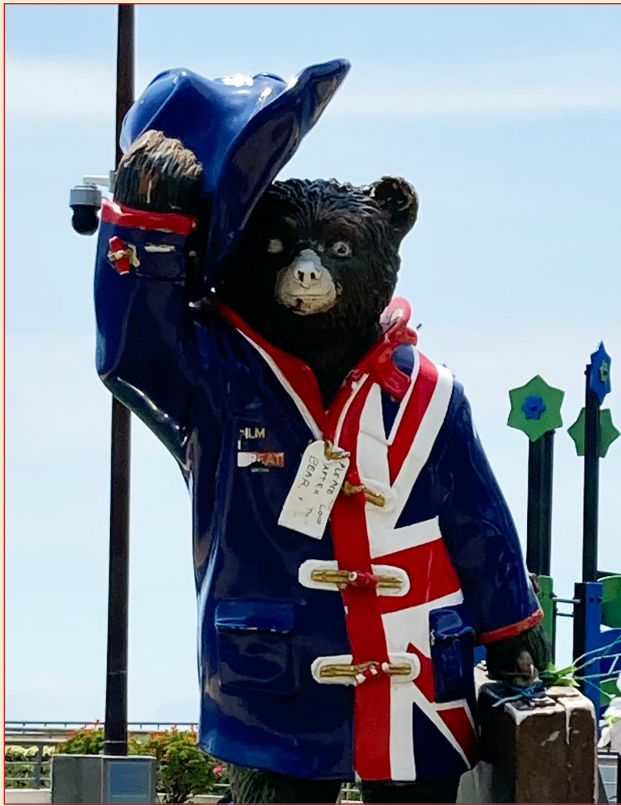
Paddington Bear - ready to depart from Peru for England.