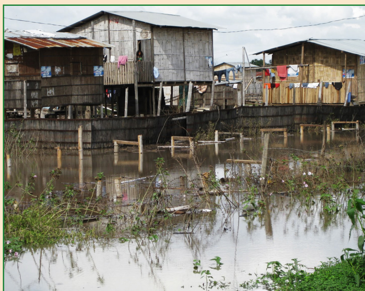
Homes on stilts in Ecuador