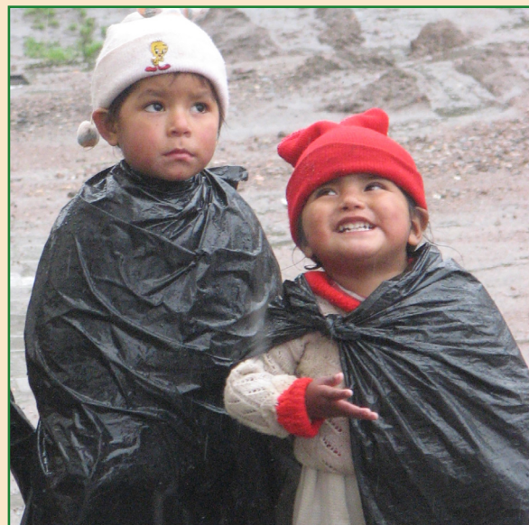
The rainy season!