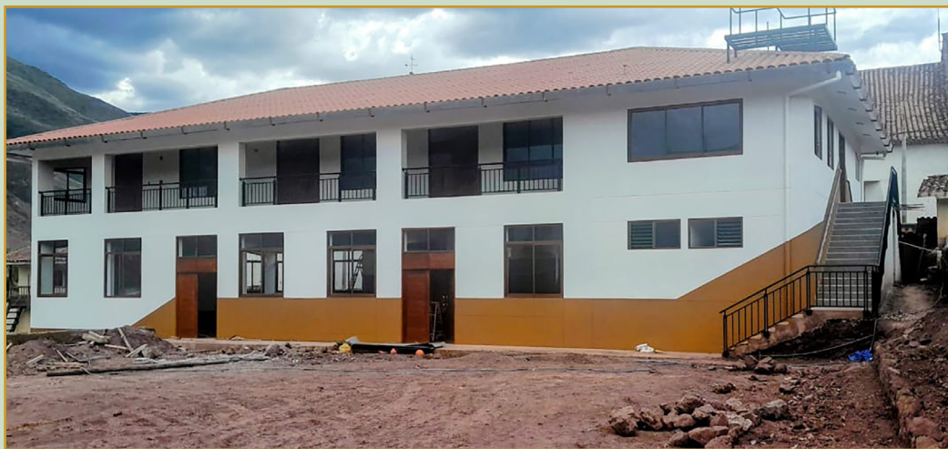
The newly constructed Parish Center in Oropesas, Cusco.