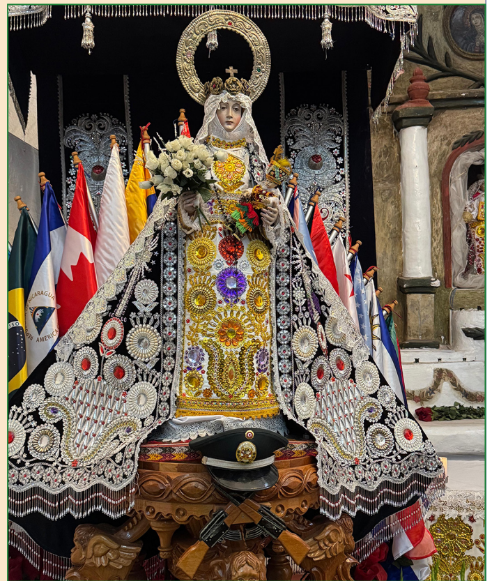
St. Rose of Lima Statue - Patroness of the Police.