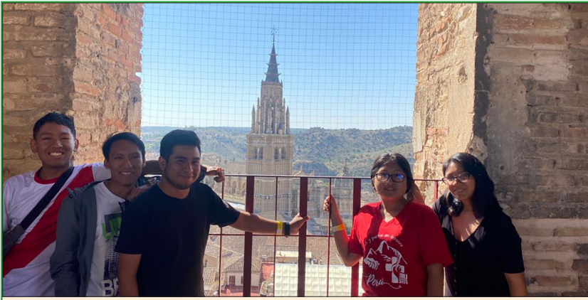
The youth from the parish, on their travels