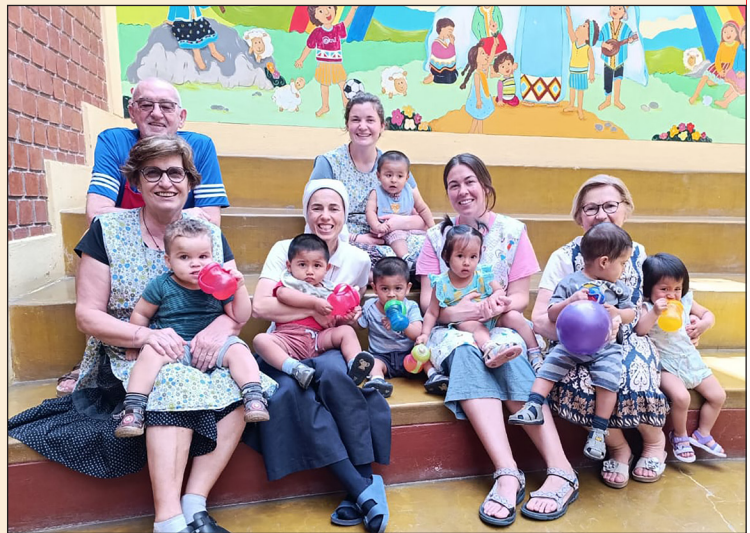
The Cenacolo Orphanage