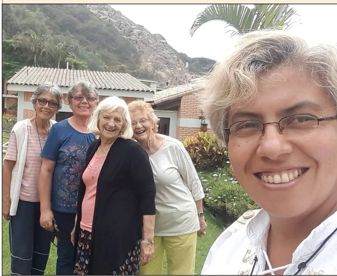
The Passionist Sisters