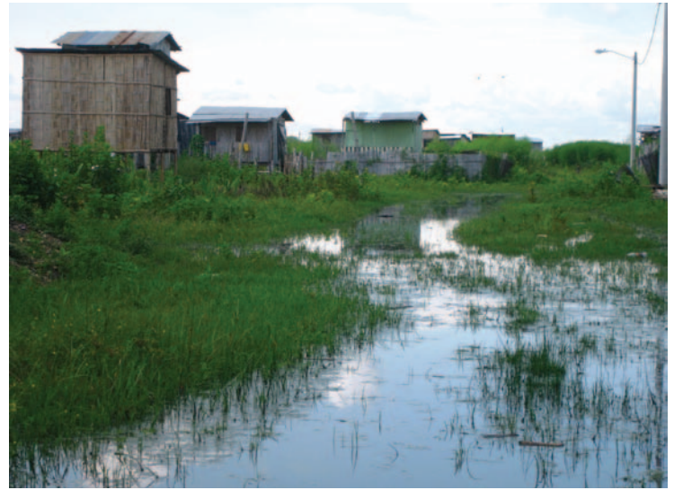
Flooding during the rainy season leads to mosquito infestations.

villages. For the first year every day was brand new for me and it was difficult to establish a routine. Serving in Duran meant serving the poor. Inner city work meant celebrating Mass, working with the catechists and youth group, visiting the sick and attending people with needs at the rectory door. In the morning people came to the office door requesting a funeral Mass for the early afternoon. Since the poor could not afford to embalm the deceased loved ones, they requested a funeral within 24 hours. Since Duran was close to the massive Guayas River, there were times when a canoe from a nearby island with 2 or 3 people would arrive to inform us that in 2 hours a family with a deceased relative will be arriving in another canoe. They wanted a funeral Mass when the canoe arrived.