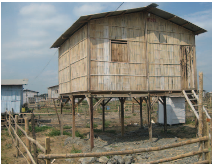
Families in San Bernabe prepare for the rainy season and construct their houses on stilts.