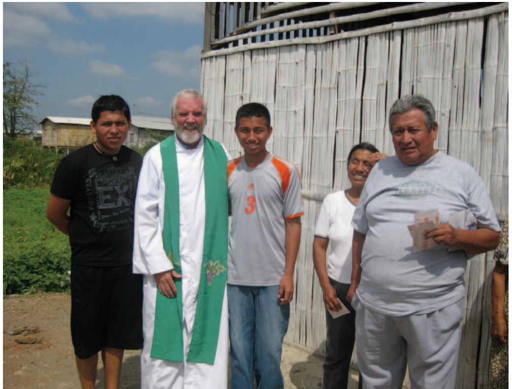
Despite the extreme financial poverty, the people are rich in faith and spirit.

me to be Director of Hispanic Ministry for the diocese and this lasted ten years. Even though I was serving the needs of the Spanish speaking in my diocese, I still had a longing to live in Ecuador. There was a greater need in Ecuador than in the United States. Yes, there is a need for priests in the United States, but the need in Ecuador was greater. The ratio of priest to parishioner in the USA is estimated at 1:1500 while in Ecuador the ratio is 1:25,000. In parts of Ecuador there is no presence of a Catholic priest. During the past seventeen years I visited Ecuador and Peru and the longing was as strong as ever. I finally started a dialogue with my bishop. He gave me the green light to start the process of returning to the missions in South America.